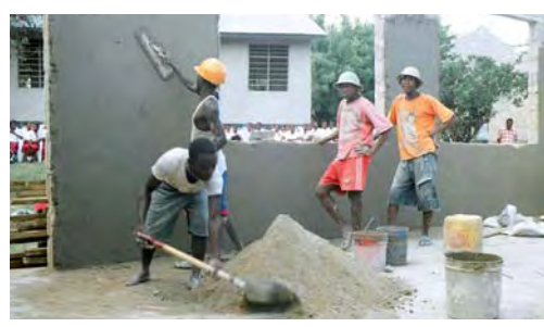
Workers executing their tasks at the construction site.